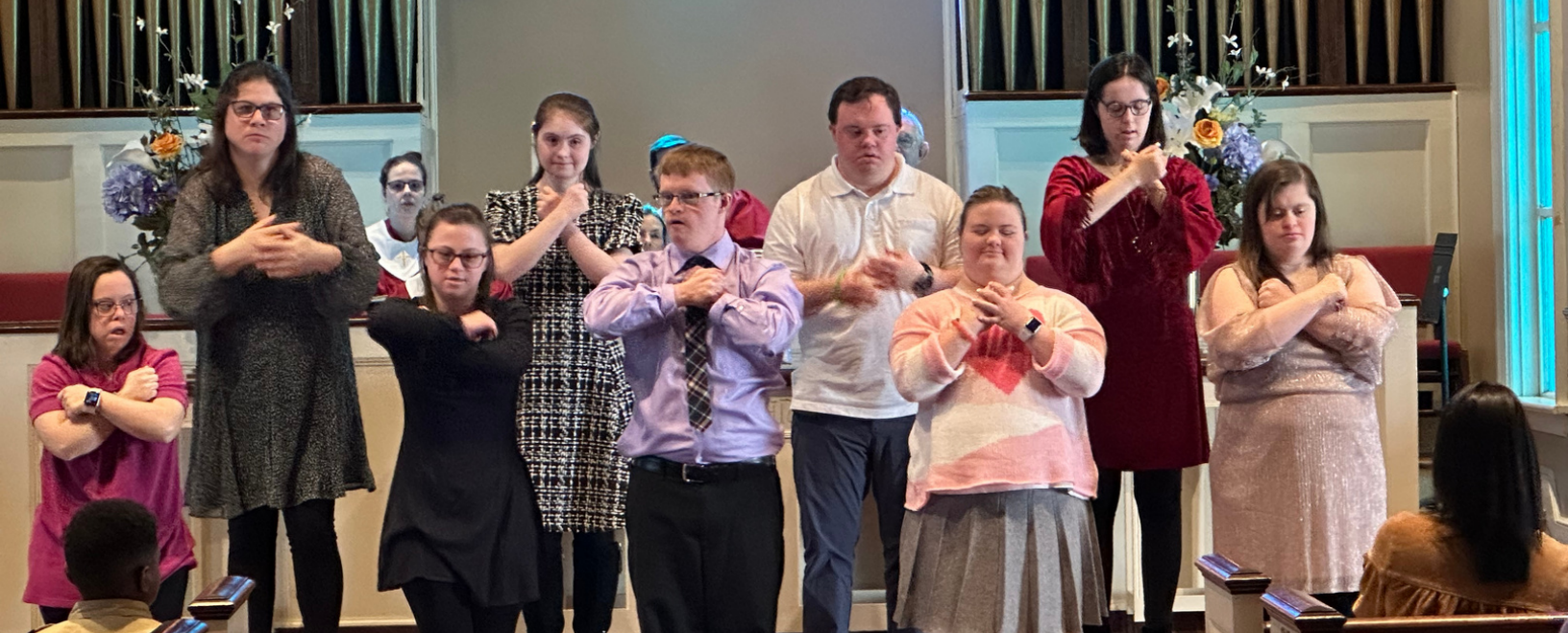
Madonna Learning Center's Celebration Troupe led worship through sign on February 12th.