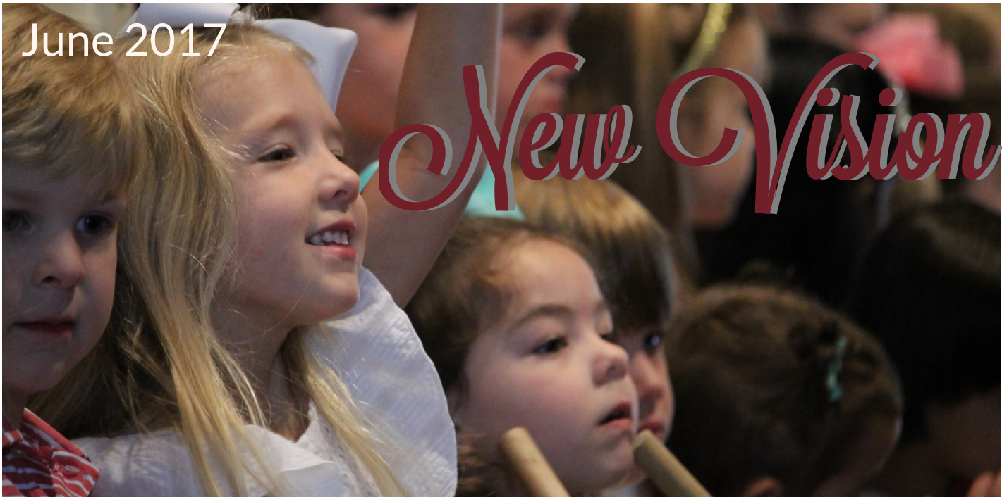
Farmington Presbyterian Day School ended the school year with a fantastic music and art show.