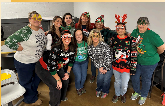
FPDS Christmas Program