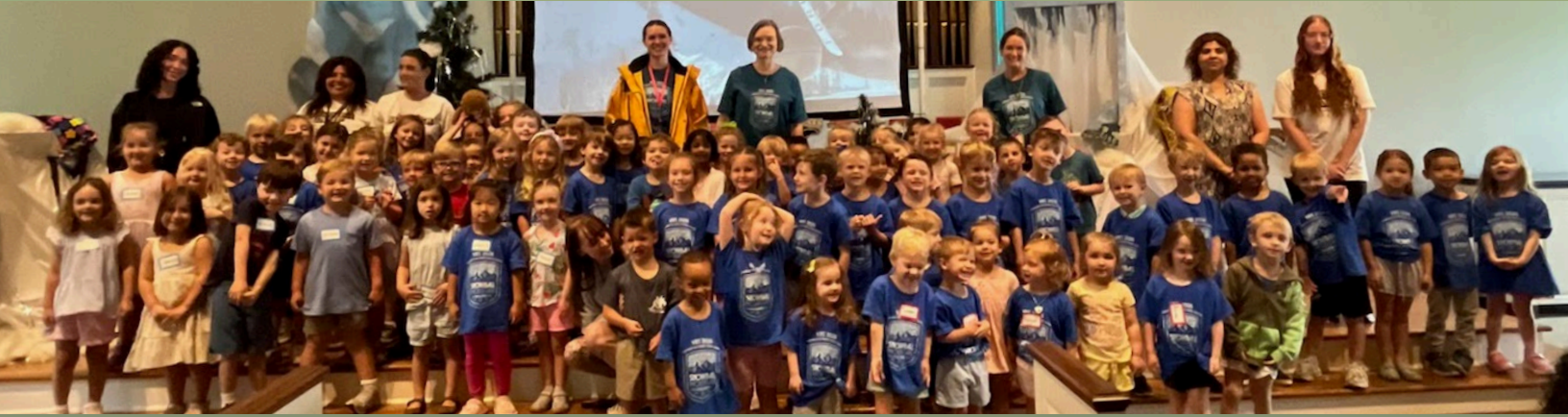
Vacation Bible School Preschoolers